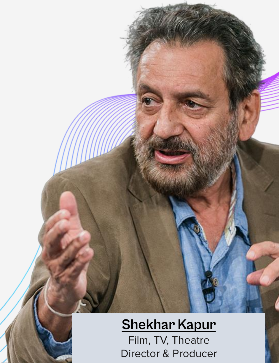
Shekhar Kapur Film, TV, Theatre Director & Producer

A key issue in Writer’s Guild of America strike we witnessed earlier this year was the use of Generative AI for scripting and screen writing – a topic that garnered greater attention through its use in Blackmirror’s Season 6 opener “ Joan is Awful ”. It will most likely be a prime example in this dialogue session, and one that many in the audience will be able to relate to.